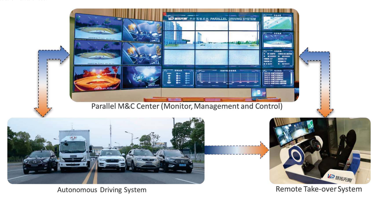
Fig. 5. Parallel driving 3.1 demo at IEEE IV 2018 by iPDA.

(e.g., artificial intelligence) are exploited to handle pollution, resources, and economy in these cities. By adding parallel driving into the transportation system, adding parallel blockchain into the economy, adding the parallel medical systems into the hospital, and adding parallel agriculture into the farming, these cities are becoming emerging topics for smart societies, raising many new issues for computational social systems.