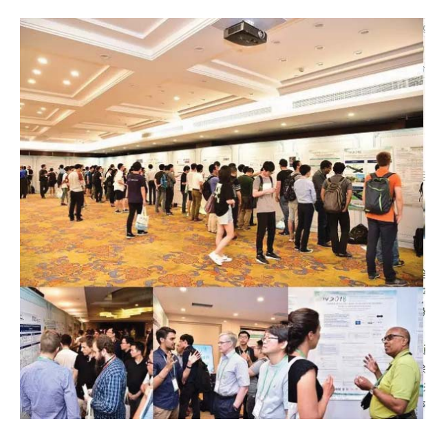
Fig. 3. Poster Sessions of the 29th IEEE Intelligent Vehicle Symposium.

the IV conference organizers on IV, parallel driving, and their impacts to the future smart societies in the end of this article.