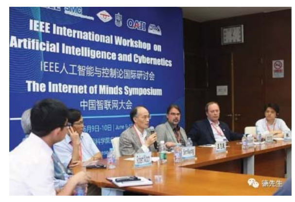
Fig. 1. Social Media Session for Artificial Intelligence and Cybernetics and the first Internet of Minds Symposium.

According to the latest statistics released by Elsevier, TCSS received a 62.5% increase in the number of citations in 2017 and a 69.23% increase in the number of published articles from 2014 to 2016. This resulted in a CiteScore value of 2.36, which is ranked 17th out of 226 publications (i.e., top 8%) in the category of "Social Sciences," and is also in the top 15% and 29% in the categories of "Modeling and Simulation" and "Human–Computer Interaction." TCSS has been indexed by the Emerging Sources Citation Index since January 2018 and other scientific databases including Engineering Index and Scopus is the name of an abstract and citation database of peer-reviewed literature, and we should expect TCSS be included in the Science Citation Index soon.