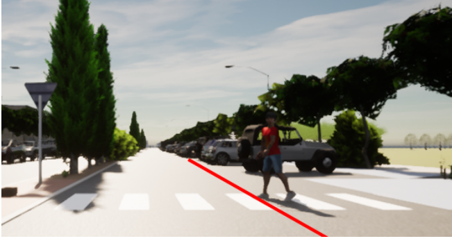
Fig. 4. The crossing event is defined when the pedestrian enters the vehicle lane and is exposed to a possible collision.

the previous crossing decision event (i.e., the moment when the pedestrian makes the decision to cross the road, which is more difficult to measure) because it can be unequivocally identified by means of the lane marking. If the subject perceives that the situation is more risky and hesitates to cross, we detect this in a subsequent crossing event. Both braking maneuvers are repeated in every experiment, so the crossing event is needed for directly observable measurements to be meaningful in the study.