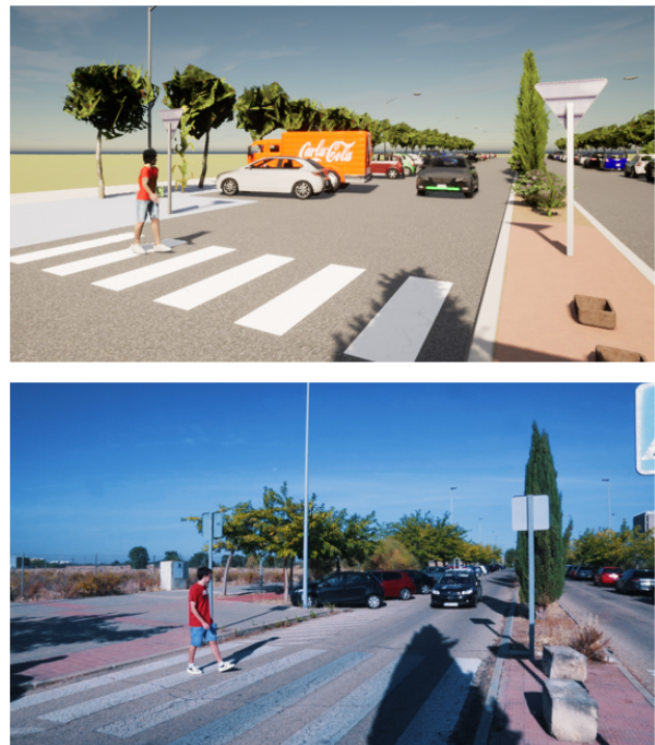
Fig. 1. Digital twin for human-vehicle interaction in autonomous driving. Virtual (above) and real (bottom) setting.

Conversely, the effectiveness of virtual reality (VR) in conducting human factors research within the realm of interface design has been widely acknowledged, due to issues of safety and control of the experimental setting for each trial [10]. A pedestrian VR simulator can generate the possibility of participants being hit by the vehicle and create the real sense of fear in them [11]. The ability of the simulator