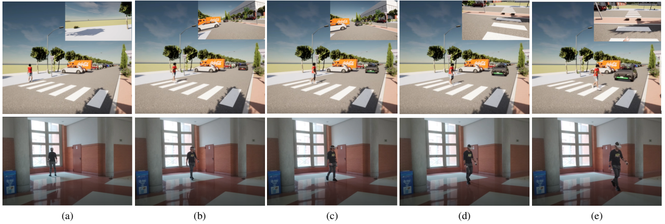
Fig. 5. Interaction example between pedestrian and virtual vehicle equipped with external HMI: (a) The pedestrian starts with their back to the crosswalk and is told to turn around when the vehicle approaches. (b) The pedestrian makes eye contact with the vehicle and hesitate to cross. (c) The external HMI switches from red to green. (d) The pedestrian enters the vehicle lane establishing the crossing event. (e) The pedestrian crosses the road.