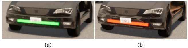
Fig. 2. External HMI activated communicating a green status (a) and a red status (b).

As the objective of this experiment is to carry out a study of communication interfaces for autonomous vehicles under simulated conditions but whose result can be compared with